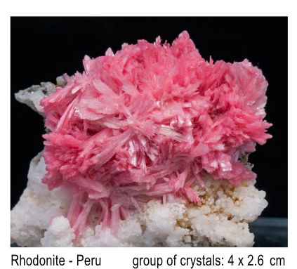
Rhodonite - Peru