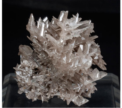
Cerussite - Nakhlak Mine, Iran