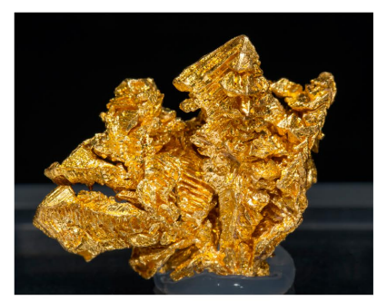
Gold - Serra do Caldeirão, Brazil