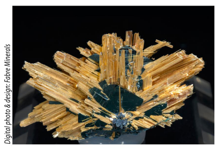
Rutile - Caí bom Mine, Brazil